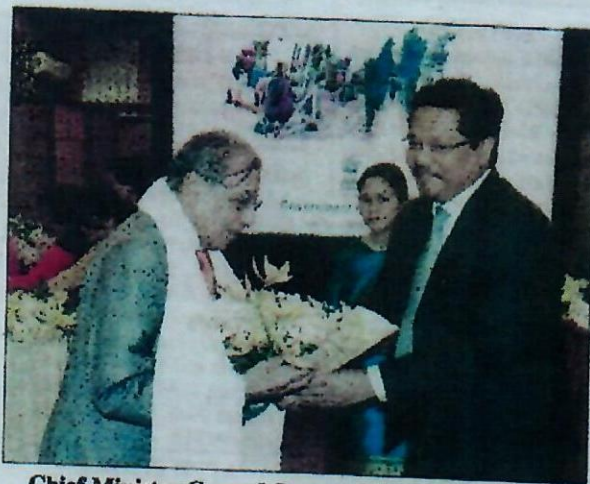
Chief Minister Conrad Sangma presents a bouquet to Chairman of the 15th Finance Commission, NK Singh, in the city on Tuesday.

The state has asked for Rs 4,956 crore for building roads and bridges, Rs 580 crore for health and family welfare, Rs 1,114 crore for water supply and sanitation, Rs 2,476 crore for power sector, Rs 957 crore for education, Rs 940 crore for judiciary, Rs 314 crore for animal husbandry, Rs 2,199 crore for sports and youth affairs, Rs 100 crore for parliamentary affairs, Rs 50 crore for transport, Rs 1,048 crore for law and order, Rs 442 crore for tourism, Rs 104 crore for information and communications technology and Rs 325 crore for commerce and industries for five years.