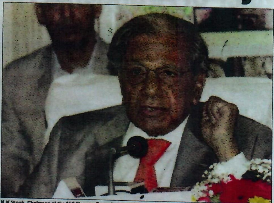
N.K Singh, Chairman of the 15 th Finance Commission, addressing the media at Shillong.

"...they can count on the FC to take a sympathetic view before we begin to finalise and affirm our recommendations towards the end of the year and it will be our endeavor to see that the government of Meghalaya is supported in the multiple endeavors to be able to have really great GDP growth, which measure up to the expectations and can im-