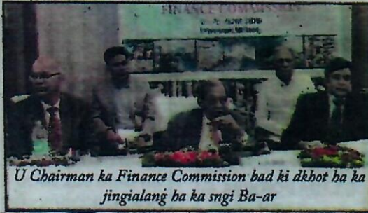
U Chairman ka Finance Commission bad ki dkhot ha ka jingialang ha ka sngi Ba-ar

Ka Sorkar Jylla ka la buh ka jingtyrwa ban pan na ka 15th Finance Commission ban mang pisa T. 82,815 klur na ka bynta san snem (2020-2025), katba ka Commission ka ai jingmut ia ka Jylla ban shim ki lad ki lynti ban kham pynkhlaiñ ha ka liang ka ... Pule Sla 9