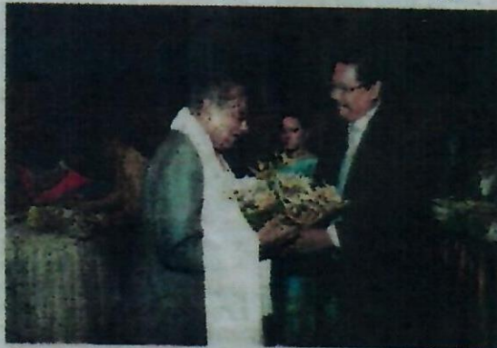
Chief minister Conrad Sangma welcomes Finance Commission chairperson Nand Kishore Singh on Tuesday.

These include Rs 4,956 crore for roads and bridges, Rs 2,476 crore for power, Rs 2,199 crore for sports and youth affairs, Rs 1,114 crore for water supply and sanitation, Rs 1,048 crore for law and order, Rs 957 crore for