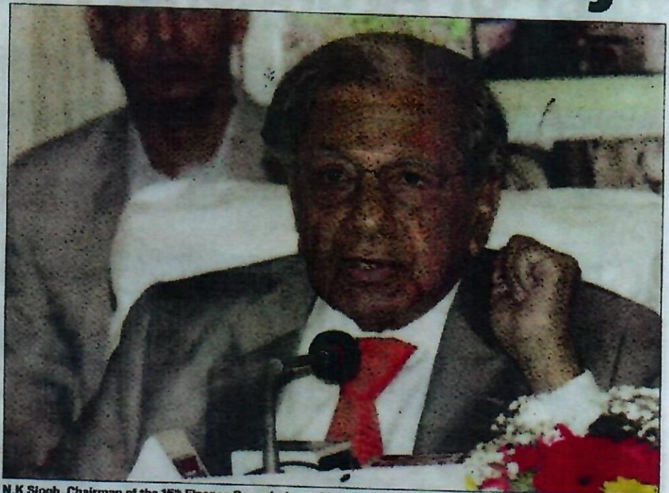
N.K Singh, Chairman of the 15 th Finance Commission, addressing the media at Shillong.

"...they can count on the FC to take a sympathetic view before we begin to finalise and affirm our recommendations towards the end of the year and it will be our endeavor to see that the government of Meghalaya is supported in the multiple endeavors to be able to have really great GDP growth, which measure up to