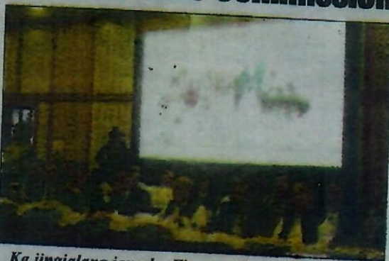
Ka jingialang jong ka Finance Commission ba 15.