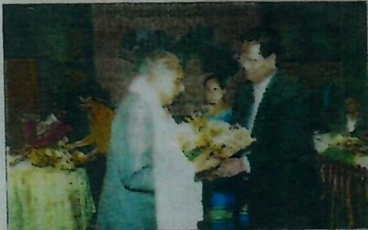
U Myntri Rangbah u dang pdiang sngewbah ia u Chairman ka Finance Commission ha Shillong/