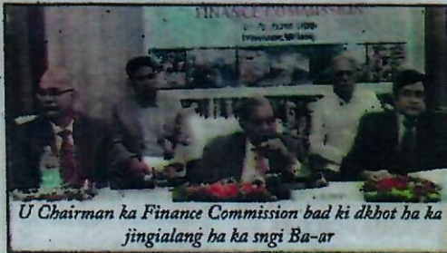
U Chairman ka Finance Commission bad ki dhot ha ka jingialang ha ka sngi Ba-ar

Ka Sorkar Jylla ka la buh ka jingtyrwa ban pan na ka 15th Finance Commission ban mang pisa T: 82,815 klur na ka bynta san snem (2020-2025), katba ka Commission ka ai jingmut ia ka Jylla ban shim ki lad ki lynti ban kham pynkhlaiñ ha ka liang ka ...Pule Sta 9