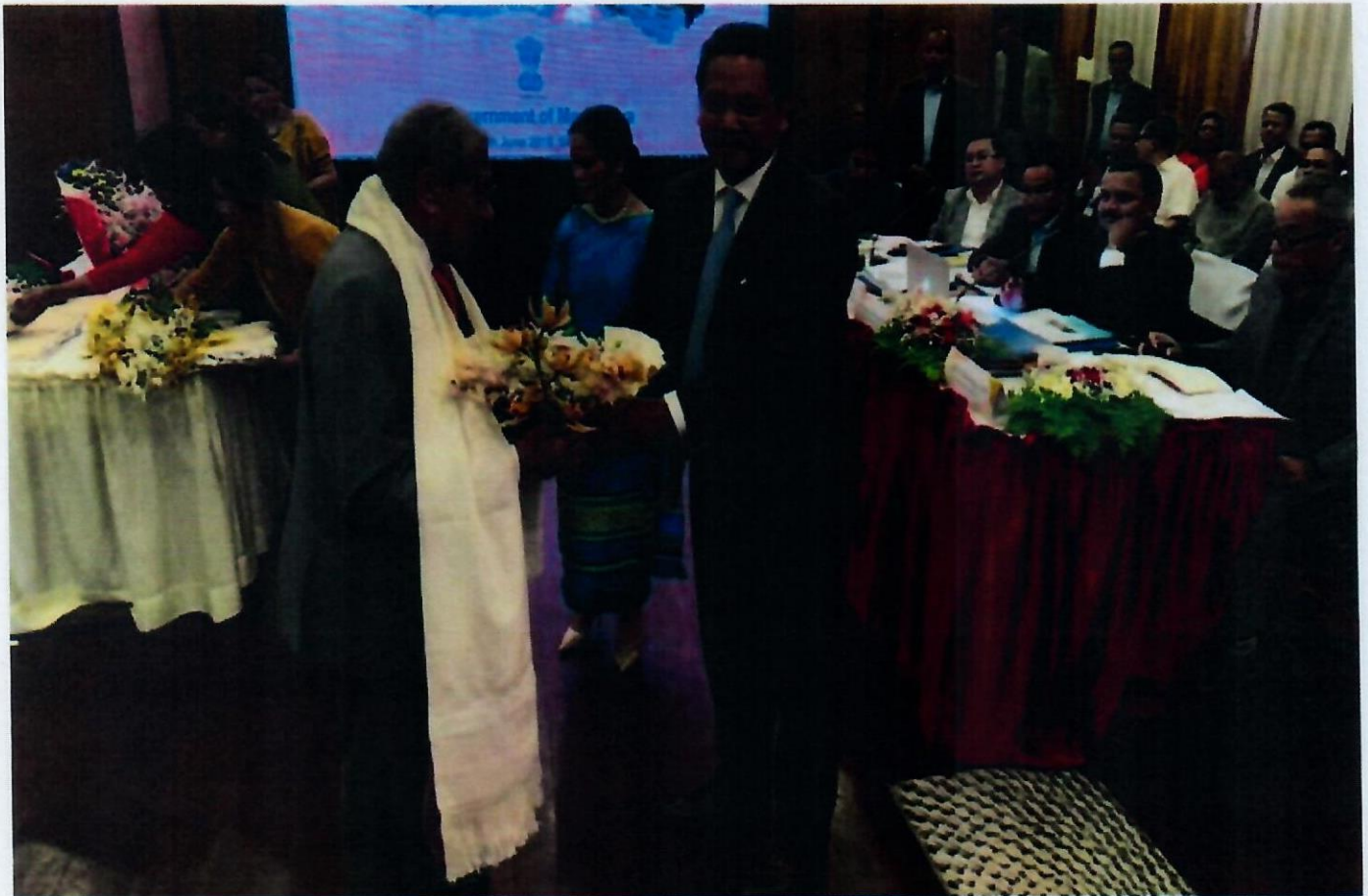
Meghalaya chief minister Conrad K. Sangma receiving 15th Finance Commission chairman N.K. Singh in Shillong.

Meghalaya chief minister Conrad K. Sangma on Tuesday received the chairman of the 15 th Finance Commission, N.K. Singh in Shillong.