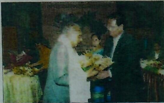
U Myntri Rangbah u dang pdiang sngewbah ia u Chairman ka Finance Commission ha Shillong/