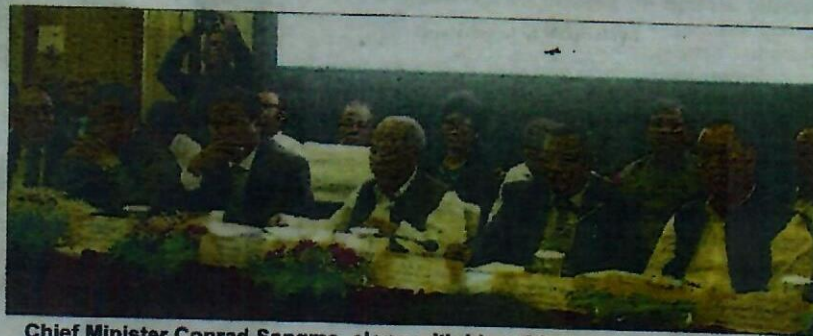
Chief Minister Conrad Sangma, along with his cabinet ministers and senior officials of the state government during a meeting with the Fifteenth Commission on Tuesday.

During the meeting it was found that own-tax revenue of Meghalaya as of GSDP is 4.38 per cent in 2016-17 as compared to the average for North-East and hill states which is 5.02 per cent.